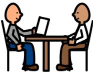
Attend volunteer interview

Autism Nova Scotia's Program Coordinator reviews all Volunteer Applications and connects with all volunteers to arrange an interview.